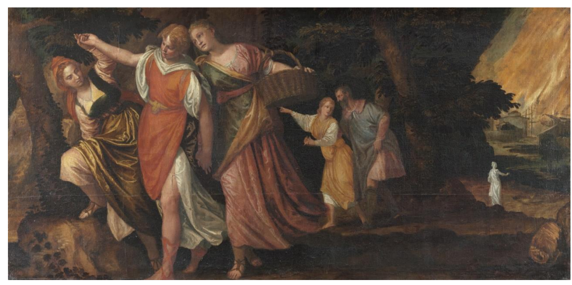
Paolo Veronese and workshop, Lot and his Daughters, c. 1585 © Kunsthistorisches Museum Wien

'The two paintings from the Duke of Buckingham Series are a wonderful example of Paolo Veronese's late work. We see an artist at the height of his powers: the grandeur, colours and composition are all executed to perfection. The work also offers an excellent reflection of the nobility's international view of art and culture. It belonged to Charles de Croÿ's collection and several European families expressed an interest in the work following his death. The Duke of Buckingham eventually purchased the series. The metamorphosis of these paintings following their thorough restoration is enough in itself to justify a visit to the exhibition.'